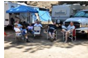
Fun Time Campers