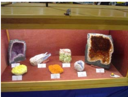
Cabinet Minerals on display