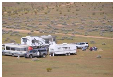
Overlooking the campsite at Boron