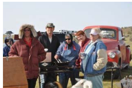
Dutch Oven cooking