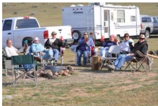
Gathered around the campfire