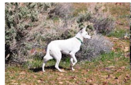
Cana on the prowl