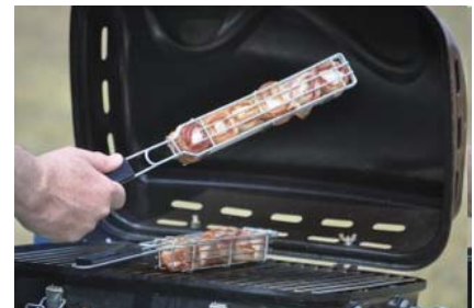
Cooking bacon wrapped scollaps